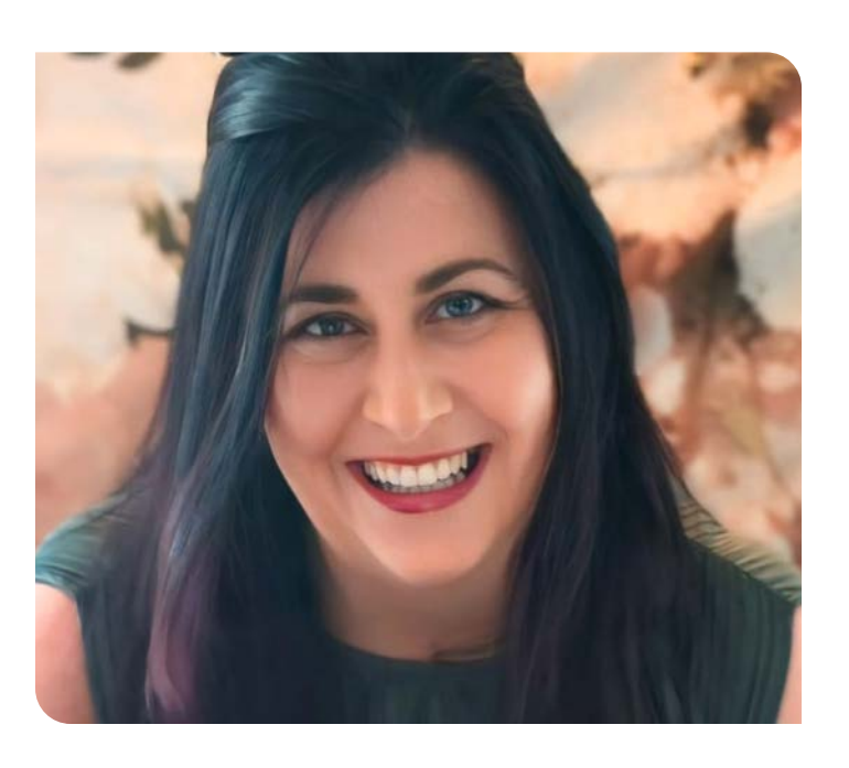
We walked in the footsteps of generations of my family members, and we are so grateful," reads one review.

Thankfully, business is back with a vengeance, and My Ireland Family Heritage is 90 percent booked for 2024. Online testimonials bear witness to the company's stellar reputation;